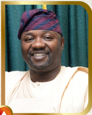
HON. (PRINCE) TAOFEEK ABIMBOLA AJILESORO MHR, Ife Federal Constituency