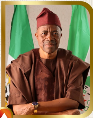
HIS EXCELLENCY (PRINCE) KOLA ADEWUSI Osun state Deputy Governor