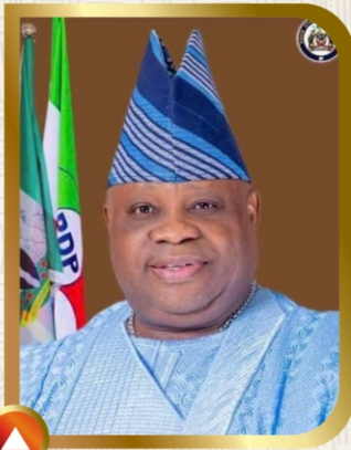
HIS EXCELLENCY SEN. ADEMOLA JACKSON NURUDEEN ADELEKE Executive Governor, Osun State