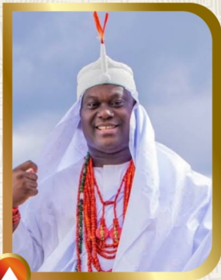
HIS IMPERIAL MAJESTY ADEYEYE ENITAN OGUNWUSI OJAJA II Ooni of Ife